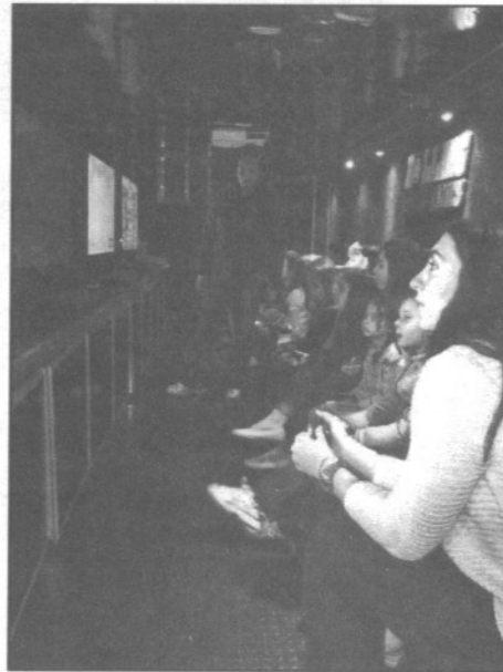
(Right) Inside the rolling video games truck playing Wii games.

The Rolling Video Games truck pulled up to school with tons of games for kids to play with their friends. Most popular were Mario Kart Wii and Wii Olympics . When the kids were not inside the truck playing games, they were making hamantaschen and "cups of dirt" with gummy worms, and playing games. It was a fantastic night for all!