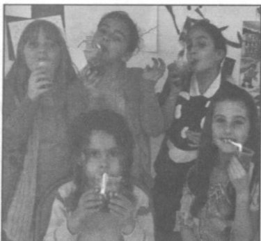
(Right) Making hamantaschen